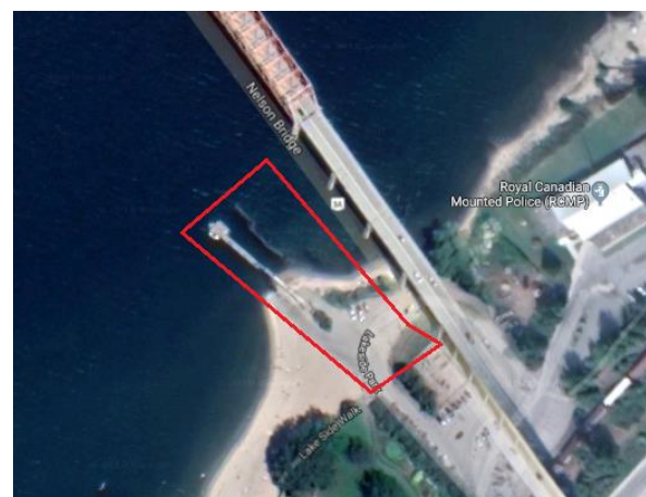
Southwest of orange bridge – by Lakeside Park & boat launch.