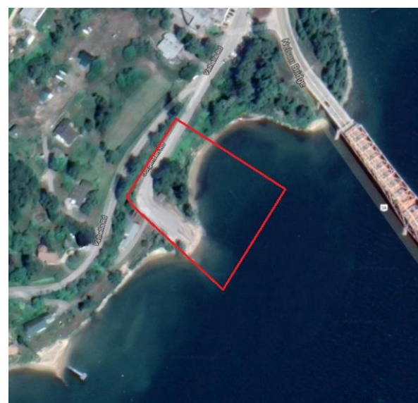
Northwest side of orange bridge – at the end of Jorgensen Rd.