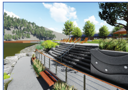
Designer rendering of the new Waterfront Plaza adjacent to the Prestige Lakeside Resort on Kootenay Lake.

Over the next few weeks and months, the underground infrastructure work will begin along Hall Street between Lakeside Drive and Lake Street. The street will then be fully renewed with new sidewalks, road resurfacing, street lights and street trees. It will be pedestrian friendly and beautiful. The following is the anticipated schedule for the four stages of the project: