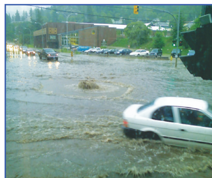
Underground infrastructure work will mitigate flooding at the intersection at Hall and Front Streets.

This project will have significant benefits to the area as the new storm water improvements will greatly reduce the impact of weather events flooding the intersection at Hall and Front Streets and adjacent businesses. In addition, new sidewalks will be constructed and roads resurfaced, which will tie into the previous Phase I construction on upper Hall Street. Much of the work to date has been focused on the area adjacent to the Prestige Lakeside Resort including the installation of the new storm water underground infrastructure and the new outfall into the lake, the waterfront plaza and waterfront steps. The City received a grant of $4,441,000 which will fund 66% of the project , with the remaining funds for our normal water, sewer, electrical and roads upgrades coming from reserve accounts set aside for these ongoing city-wide infrastructure improvements.